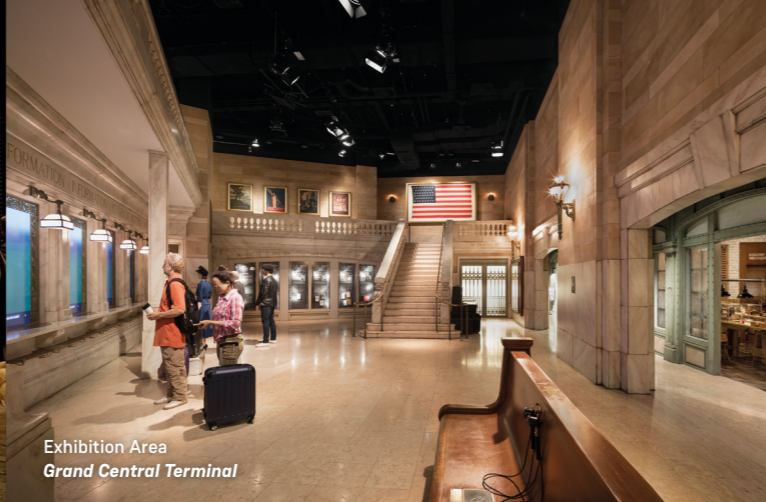
Exhibition Area Grand Central Terminal