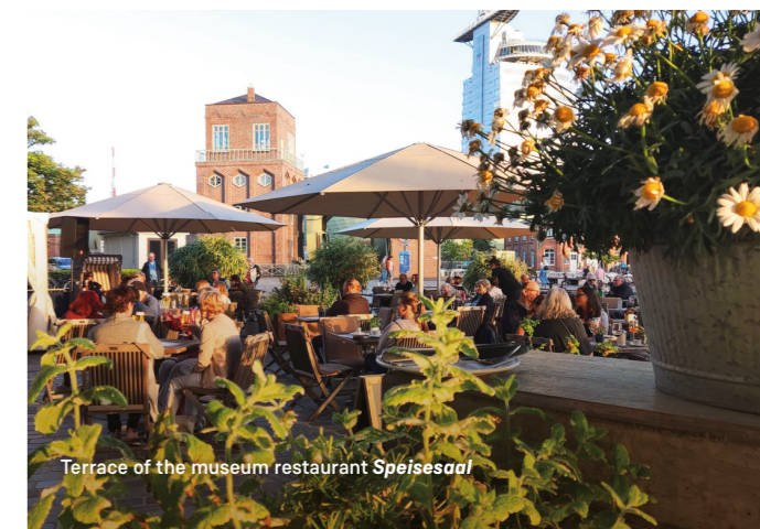
Terrace of the museum restaurant Speisesaal