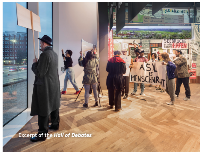
Excerpt of the Hall of Debates

In the new part of the exhibition, you will learn about GERMANY AS A COUNTRY OF IMMIGRATION from many perspectives: How did immigrants build their lives for themselves here? Discover their impressive stories. How has society shaped coexistence? Answers are provided through social debates and individual life plans.