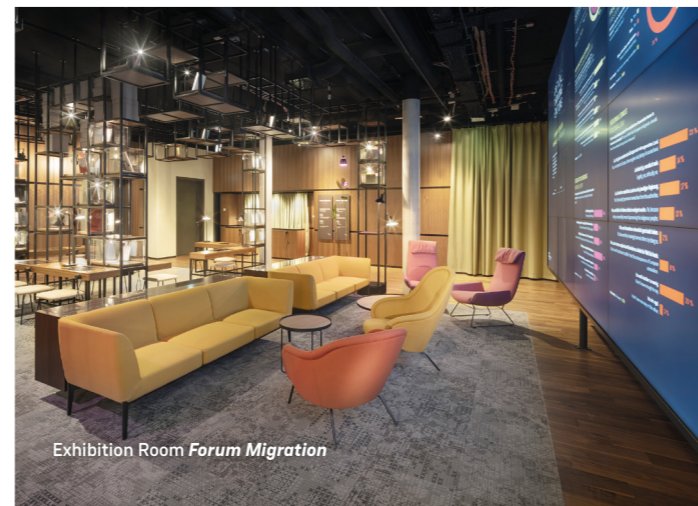
Exhibition Room Forum Migration

The new CRITICAL THINKING STATIONS open up digital spaces for thought, where you can discover and explore opinions. The survey results are presented anonymously on a large screen in the MIGRATION FORUM.