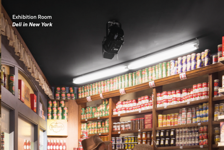
Exhibition Room Deli in New York