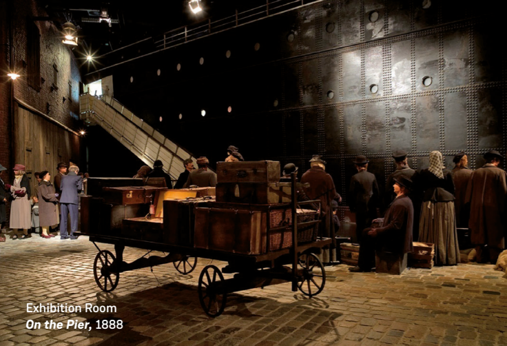
Exhibition Room On the Pier, 1888